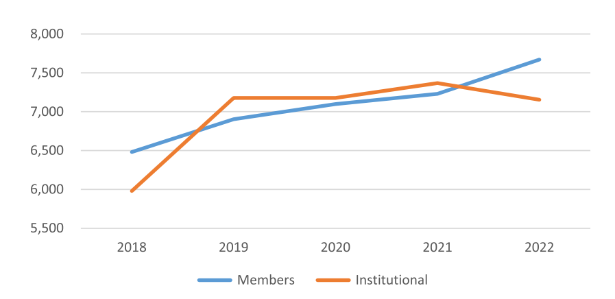
FIGURE 2.—End-of-year institutional publishing and membership, 2018–2022.

membership and institutional publishing growth. Membership numbers are also presented in detail in Table I, where part A splits the full-year membership between individual and institutional subscribers (institutional publishing numbers are discussed in detail in the next section), while part B compares the mid-year membership against past years.